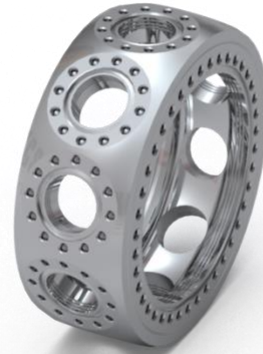
Spherical Decagon Multi-CF™ UHV Vacuum Chamber MCF600-SphDecagon-G2C10 with (2) 8.0” and (10) 2.75” CF Sealing Surface Ports